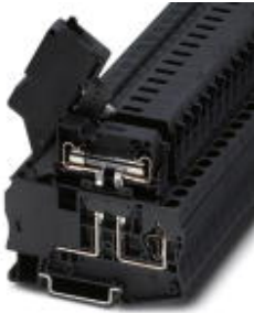
Lever-type fuse terminal block, black, for 6.3 x 32 mm G fuse inserts

Please be informed that the data shown in this PDF Document is generated from our Online Catalog. Please find the complete data in the user's documentation. Our General Terms of Use for Downloads are valid ( http://phoenixcontact.com/download )