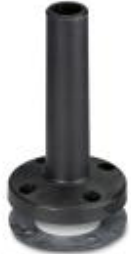
Foot with integrated tube, 110 mm long, black

Please be informed that the data shown in this PDF Document is generated from our Online Catalog. Please find the complete data in the user's documentation. Our General Terms of Use for Downloads are valid ( http://phoenixcontact.com/download )