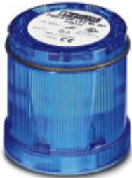
LED blinking light element, 24 V AC/DC, blue

Please be informed that the data shown in this PDF Document is generated from our Online Catalog. Please find the complete data in the user's documentation. Our General Terms of Use for Downloads are valid ( http://phoenixcontact.com/download )