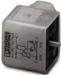
Valve connectors, 3-position, Valve connector A, with 1 LED, connected with Varistor, Screw connection, cable gland Pg9, external cable diameter 6 mm ... 8 mm

Please be informed that the data shown in this PDF Document is generated from our Online Catalog. Please find the complete data in the user's documentation. Our General Terms of Use for Downloads are valid ( http://phoenixcontact.com/download )