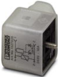
Valve connectors, 3-position, Valve connector A, with 1 LED, connected with Varistor, Screw connection, cable gland Pg9, external cable diameter 6 mm ... 8 mm

Please be informed that the data shown in this PDF Document is generated from our Online Catalog. Please find the complete data in the user's documentation. Our General Terms of Use for Downloads are valid ( http://phoenixcontact.com/download )