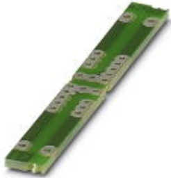
PCB for assembling electronic components

Please be informed that the data shown in this PDF Document is generated from our Online Catalog. Please find the complete data in the user's documentation. Our General Terms of Use for Downloads are valid ( http://phoenixcontact.com/download )