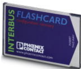
Program and configuration memory, 4 Mbyte

Please be informed that the data shown in this PDF Document is generated from our Online Catalog. Please find the complete data in the user's documentation. Our General Terms of Use for Downloads are valid ( http://phoenixcontact.com/download )