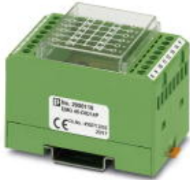
Diode module, for extension with 14 1N 4007 diodes, with a common cathode

Please be informed that the data shown in this PDF Document is generated from our Online Catalog. Please find the complete data in the user's documentation. Our General Terms of Use for Downloads are valid ( http://phoenixcontact.com/download )