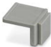
Equipment marker, narrow

Marking material - EMG-SGKS 10 - 2947585