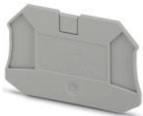
End cover, length: 64.4 mm, width: 2.2 mm, height: 42.3 mm, color: gray

Please be informed that the data shown in this PDF Document is generated from our Online Catalog. Please find the complete data in the user's documentation. Our General Terms of Use for Downloads are valid ( http://phoenixcontact.com/download )