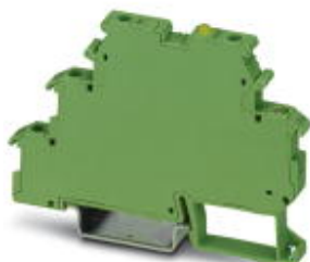
Power solid-state relay terminal block for actuator, input: 24 V DC, output: 3 - 30 V DC/3 A, terminal block width: 6.2 mm

Please be informed that the data shown in this PDF Document is generated from our Online Catalog. Please find the complete data in the user's documentation. Our General Terms of Use for Downloads are valid ( http://phoenixcontact.com/download )