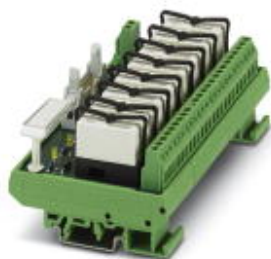
VARIOFACE output module, with 8 miniature relays, 1 PDT each, plugged, for 24 V DC (including relays)

Please be informed that the data shown in this PDF Document is generated from our Online Catalog. Please find the complete data in the user's documentation. Our General Terms of Use for Downloads are valid ( http://phoenixcontact.com/download )