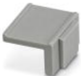
Equipment marker, width 12 mm