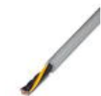
Power supply cable, gray, welding-splash-resistant in standard applications, 5 x 1.5 mm 2 , highly flexible, sold by the meter