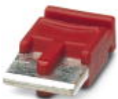
Single plug-in bridge, length: 6 mm, number of positions: 2, color: red

Single plug-in bridge - FBST 6-PLC RD - 2966236