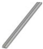
Continuous plug-in bridge, length: 500 mm, color: gray

Continuous plug-in bridge - FBST 500-PLC GY - 2966838