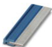
Plug-in bridge, length: 50 mm, color: blue

Plug-in bridge - FBST 50-PLC BU - 1081051