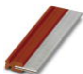
Plug-in bridge, length: 50 mm, color: red

Plug-in bridge - FBST 50-PLC RD - 1081050