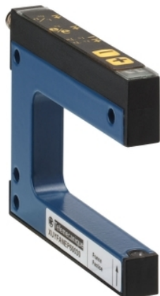
photo-electric sensor - XUY - fork - teach - 30X42mm - 12..24VDC - M8