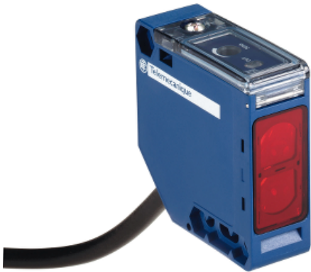
photo-electric sensor - XUK - receiver - Sn 30m - 12..24VDC - cable 2m