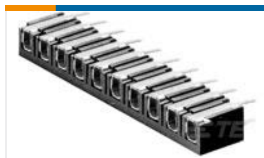
TE Part #1-87993-6 16 MODI BDMNT RCPT SR .156CL