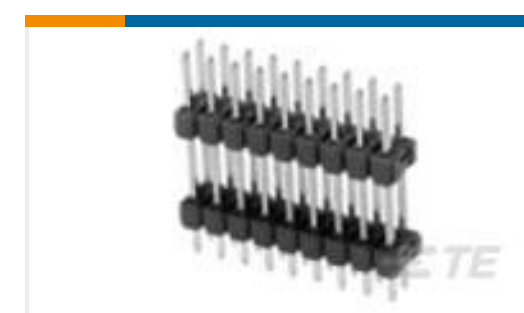
TE Part #5-146503-3 06 MODII HDR DRST UNSHRD STKG