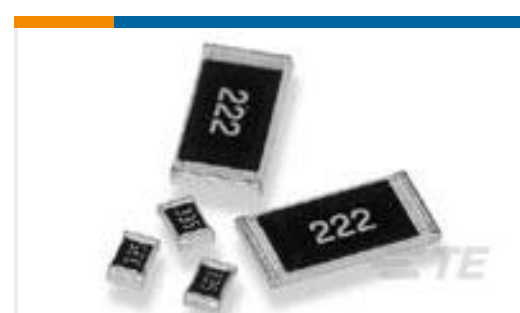
TE Part #1-1879500-4 CRGH2010 5% 47K 1W