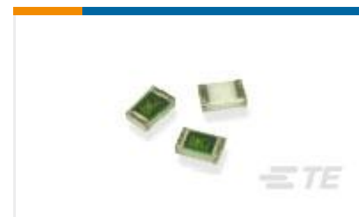
TE Part #1-1879136-9 RN 0603 20R 0.1% 10PPM 5K RL