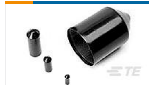
TE Part #843192-000 101A094-3/42-0