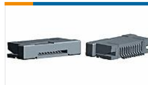
TE Part #4-1734592-7 FPC CONN. 0.5MM PITCH B/C, 46P