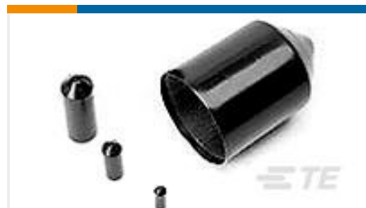
TE Part #589475-002 101A094-100/180-0