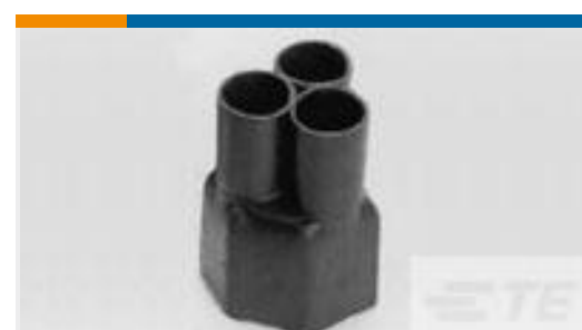
TE Part #D32325-000 T500-600FR