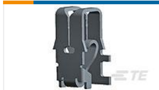
TE Part #62527-1 MAG-MATE TERM 31-32 010 TPBR