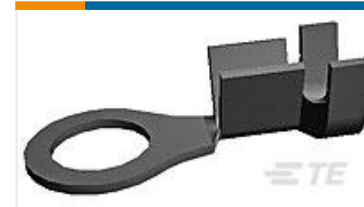
TE Part #1-1627040-2 H1863D/R5000