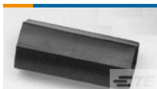
TE Part #CF2744-000 HRSR-400FR-10/226