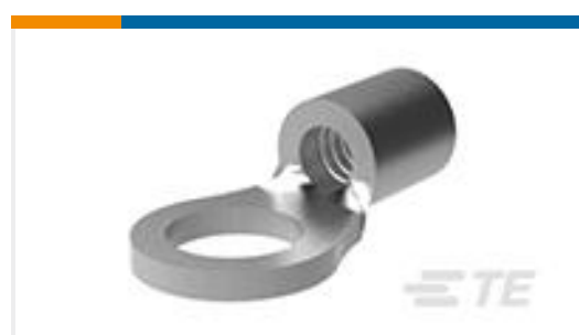
TE Part #322447-1 SOLIS R 12-10 4 SNPB 93/7