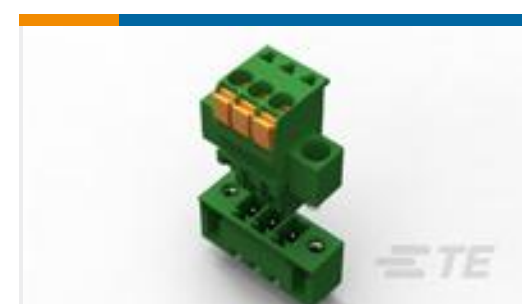
TE Part #1-1986723-2 STR PLUG SPRING TYPE RH 12P, 3.50mm