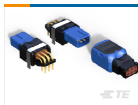
TE Part #YD369-G99- NP400000 369 9 WAY INLINE 90 PCB REC, GOLD, PIN