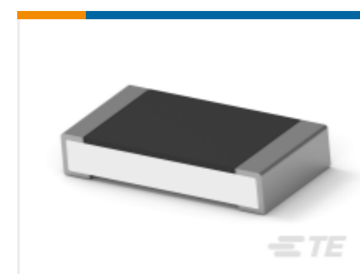
TE Part #8-2176389-5 RQ 1206 806R 0.1% 10PPM 5K RL