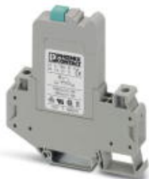
Thermomagnetic circuit breaker, 1-pos., for DIN rail mounting

Please be informed that the data shown in this PDF Document is generated from our Online Catalog. Please find the complete data in the user's documentation. Our General Terms of Use for Downloads are valid ( http://phoenixcontact.com/download )