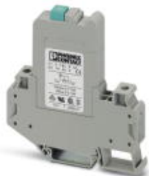
Thermomagnetic circuit breaker, 1-pos., for DIN rail mounting

Please be informed that the data shown in this PDF Document is generated from our Online Catalog. Please find the complete data in the user's documentation. Our General Terms of Use for Downloads are valid ( http://phoenixcontact.com/download )