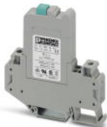
Thermomagnetic circuit breaker, 1-pos., for DIN rail mounting

Please be informed that the data shown in this PDF Document is generated from our Online Catalog. Please find the complete data in the user's documentation. Our General Terms of Use for Downloads are valid ( http://phoenixcontact.com/download )