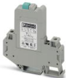
Thermomagnetic circuit breaker, 1-pos., for DIN rail mounting

Please be informed that the data shown in this PDF Document is generated from our Online Catalog. Please find the complete data in the user's documentation. Our General Terms of Use for Downloads are valid ( http://phoenixcontact.com/download )