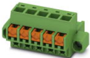
Figure shows the 5-pos. version

Plug component, nominal current: 12 A, rated voltage (III/2): 320 V, number of positions: 10, pitch: 5.08 mm, connection method: Push-in spring connection, Color: green, contact surface: Tin