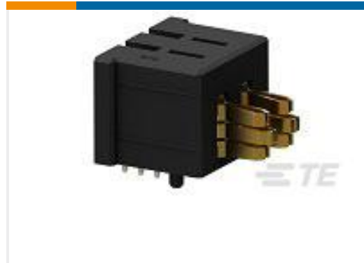
TE Part #2102440-1 FORTIS LRM,RIGHT ANGLE MODULE, MBXL