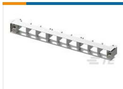
TE Part #2226783-3 FORTIS LRM, DAUGHTER CARD, 9 BAY SHELL