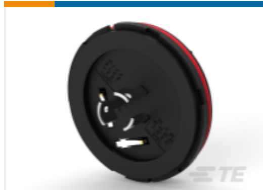
TE Part #1-2336396-1 ASSEMBLY, LIGHT CONTROLLER BASE, W /VENT