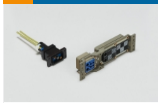
Rack & Panel Connectors(7)