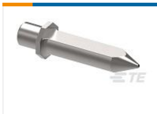
TE Part #2102502-2 FORTIS LRM, GUIDE PIN, PASSIVATED