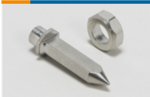
Rack & Panel Keying(4)