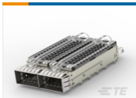
TE Part #2170808-1 QSFP28, 1X2, CAGE ASSY, SPRING, HS, LP