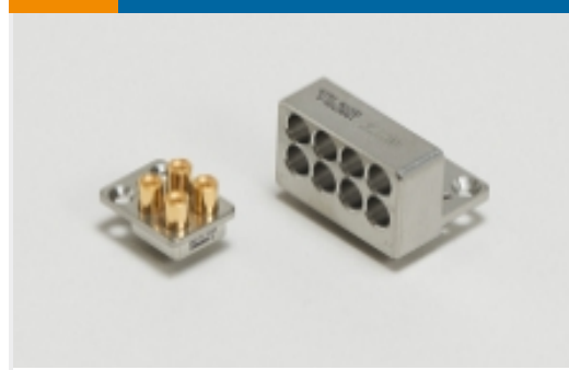
PCB RF Modules(1)