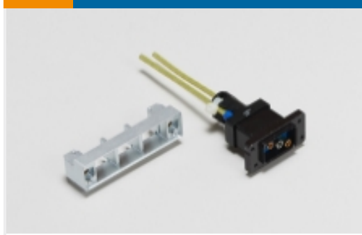
Other Rack & Panel Accessories(8)