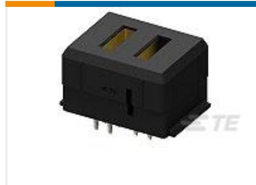
TE Part #2102442-1 FORTIS LRM,VERTICAL MODULE, MBXL