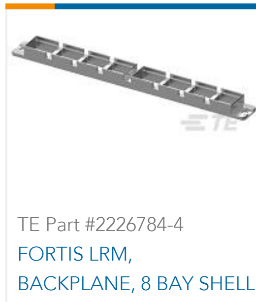
TE Part #2226784-4 FORTIS LRM, BACKPLANE, 8 BAY SHELL