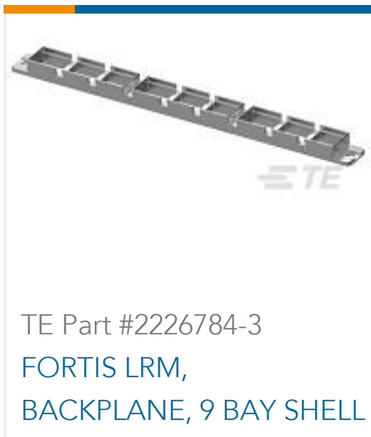
TE Part #2226784-3 FORTIS LRM, BACKPLANE, 9 BAY SHELL