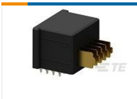
TE Part #2102444-1 FORTIS LRM,RIGHT ANGLE MODULE, UPM