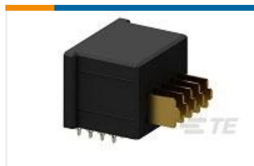
TE Part #2102444-1 FORTIS LRM,RIGHT ANGLE MODULE, UPM