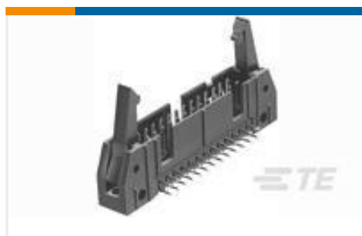
TE Part #1-499786-2 064 UNIV HDR RA 4S 15DP STD L1