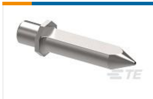
TE Part #2102502-2 FORTIS LRM, GUIDE PIN, PASSIVATED