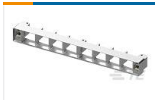
TE Part #2226783-4 FORTIS LRM, DAUGHTER CARD, 8 BAY SHELL