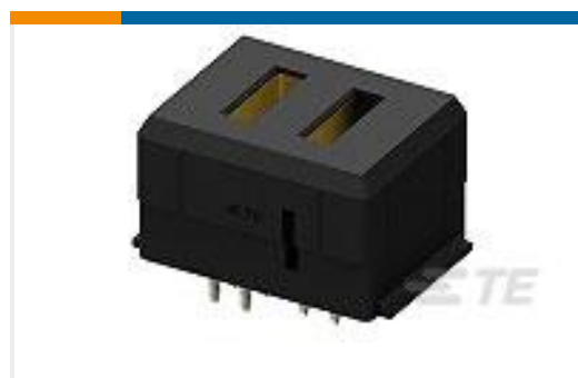
TE Part #2102442-1 FORTIS LRM,VERTICAL MODULE, MBXL