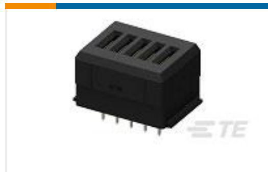
TE Part #2102446-1 FORTIS LRM,VERTICAL MODULE, UPM