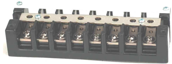
8 pole shown

Replace XX with 02, 04, 06, 08 or 12 for number of poles 1500 Series with Short Circuiting Bar