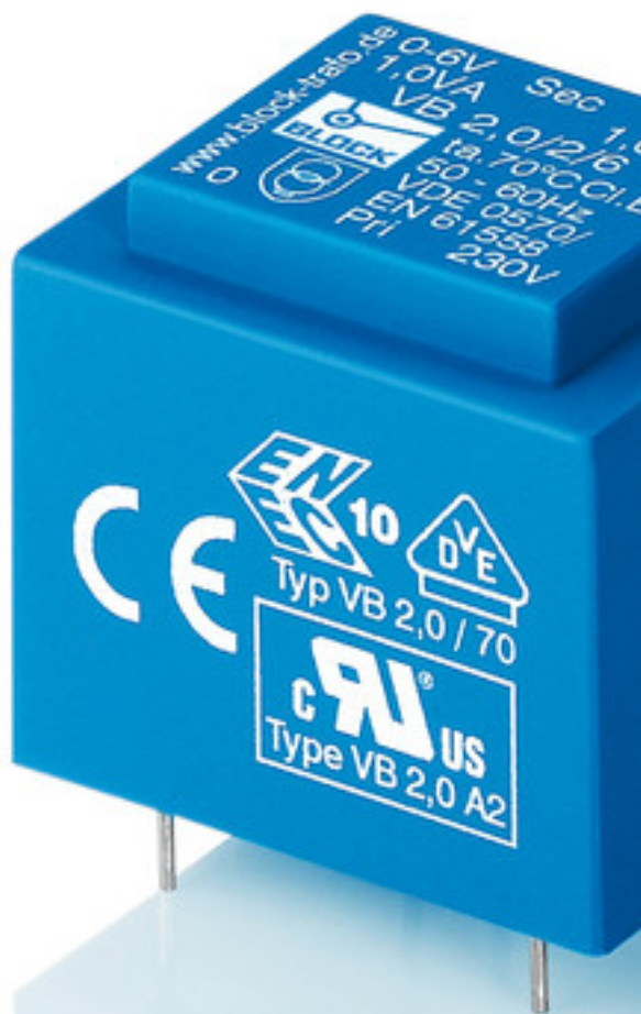
Picture shows VB 2,0/2/6