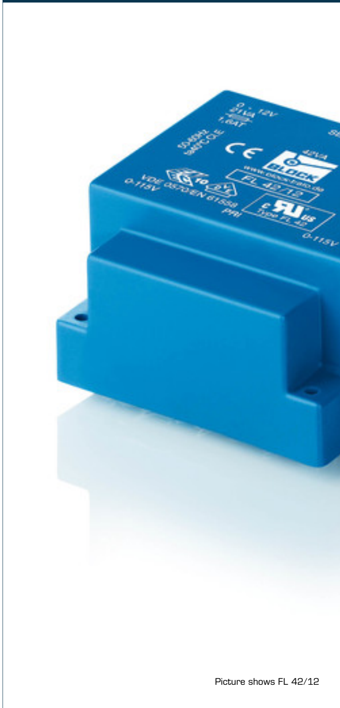
Picture shows FL 42/12