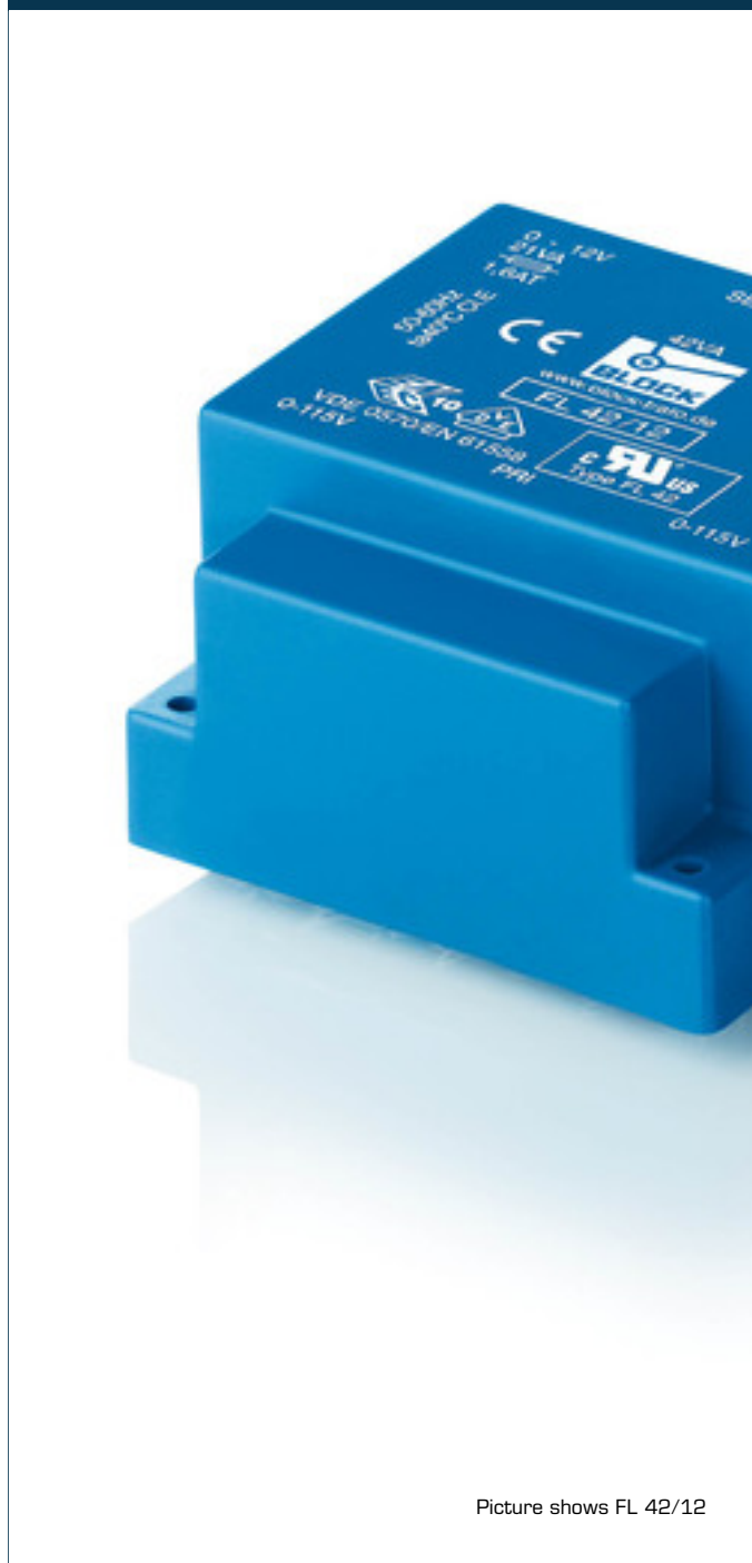
Picture shows FL 42/12